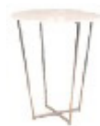
Gloss Display Table